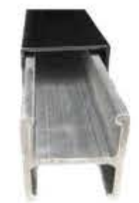
I- POST NO DIG INSERT