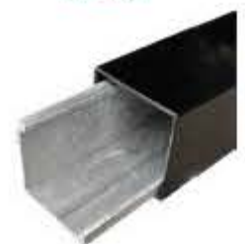
L- POST NO DIG INSERT