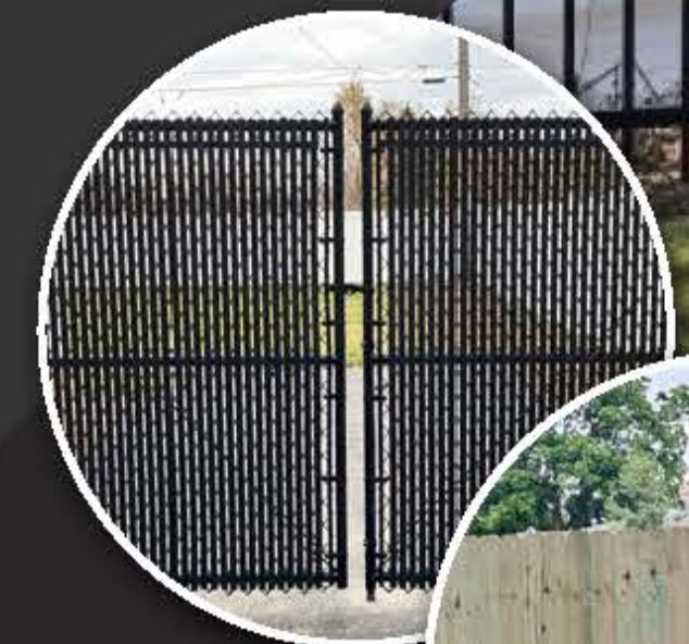
Chain Link & Wooden Fences